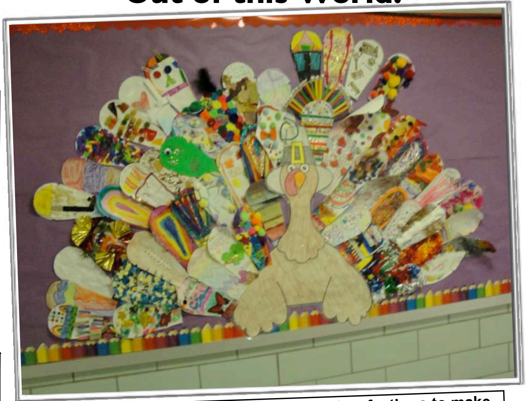
Cleveland's Third Graders created turkey feathers to make a colorful turkey bulletin board display in the Grade 3 Wing.

Cleveland's third graders have been busy writing letters to the Veterans for Operation Gratitude, and making cards for the guests of the school's Dessert Spectacular. In science, third graders learned about the moon phases, the rotation of the Earth, and the scale size of the planets. In math, the students have continued to learn about multiplication and patterns, and should be practicing memorizing multiplication facts each night. Each class completed Topic 3, and has been working on Topic 4, which is using multiplication to divide. Please keep in mind that it's more important now than ever for your child to memorize the multiplication facts for the 0-10 tables fluently.