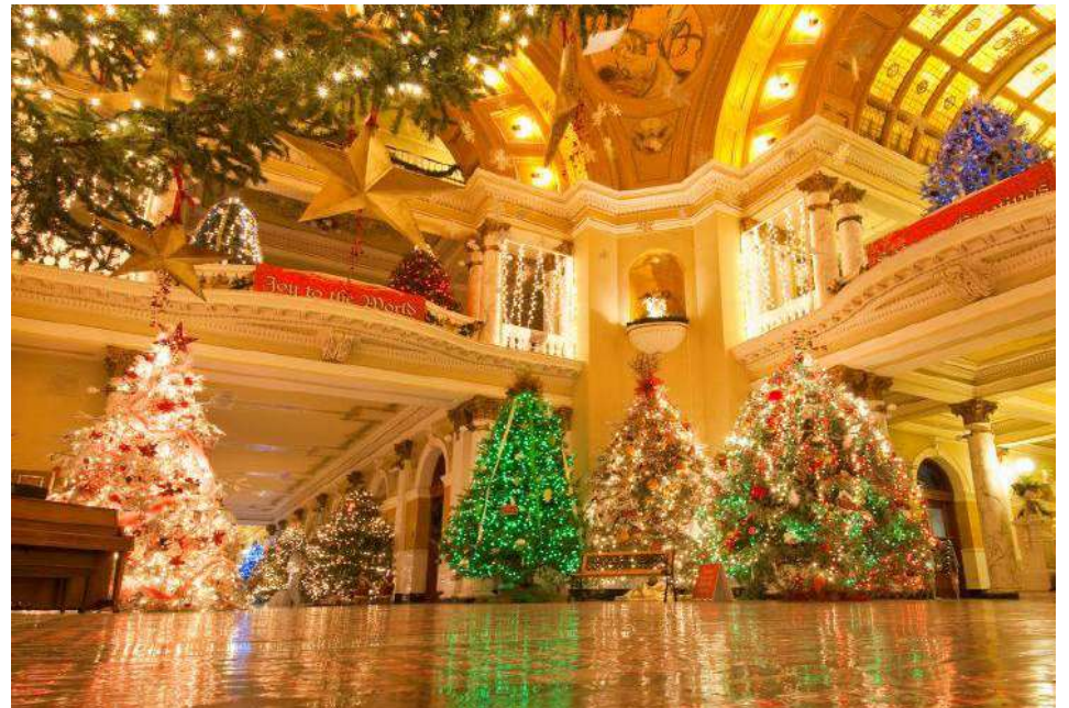
Brightly lit Christmas trees fill the Capitol's rotunda

More than 83 trees currently line the halls of the Capitol, the largest of which is a 26.5-foot Engelmann Spruce, decorated by the South Dakota Nurses Association. At the lighting ceremony, Governor Noem dedicated the tree to South Dakota's nurses and thanked them for what they have endured during the COVID-19 pandemic. After taking time to admire the