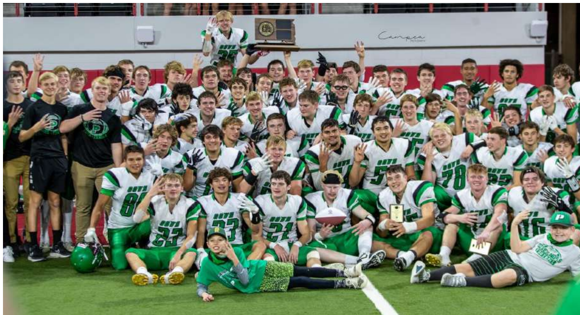
Governor football team wins State for the fourth year in a row

The Brookings Bobcats started off the third quarter at their own 17-yard line. The Bobcat offense couldn't break through the Governor defensive line and were unable to score. Neither team were able to make progress in the third quarter and the score remained 28-6 with Governors leading at the start of the fourth quarter.