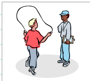
Hoops and Jump Rope for Heart—March 22 and 23

On March 22 and 23, the Health and Physical Education Departments will be sponsoring the Hoops and Jump Rope for Heart event. All students will participate during their physical education classes. This important event helps students become more