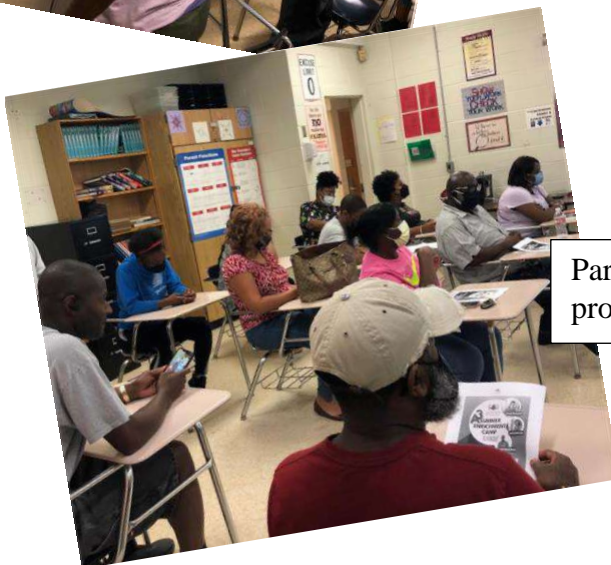
Parents and scholars during the orientation program