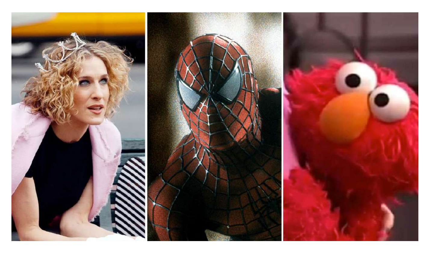
After terrorists flew airliners into the Twin Towers of the World Trade Center on September 11, 2001, killing more than 3,000 people, many producers of the entertainment media we hold dear realized some changes needed to be made. Here are some of the movies, TV shows and video games that were changed in some way to reflect post-9/11 reality.