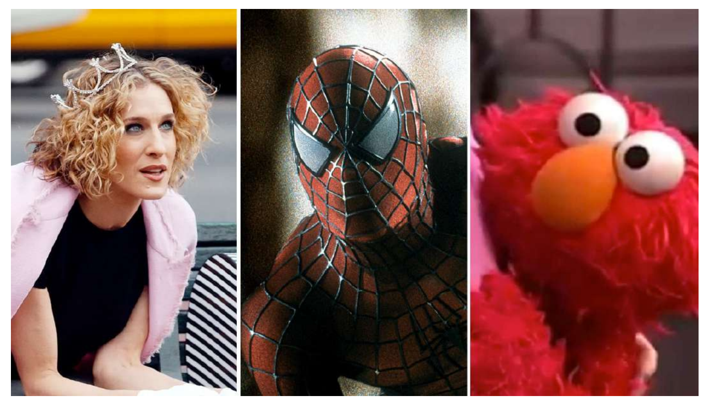
HBO; Sony; PBS