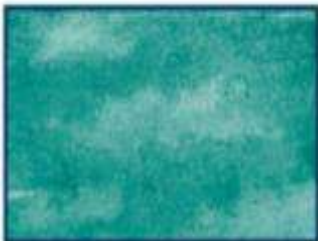
Color Lift Wet