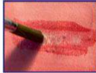
Color Lift Dry