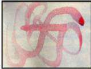
Wet on Dry