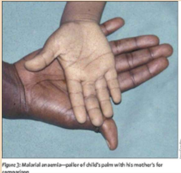
Figure 3: Malarial anaemia—pallor of child's palm with his mother's for comparison