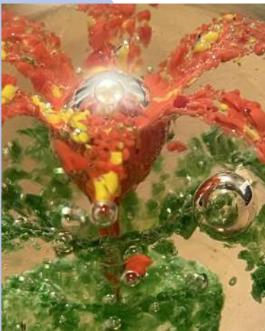
Meshak Luncsford macro digital photo diptych "Bubbles"