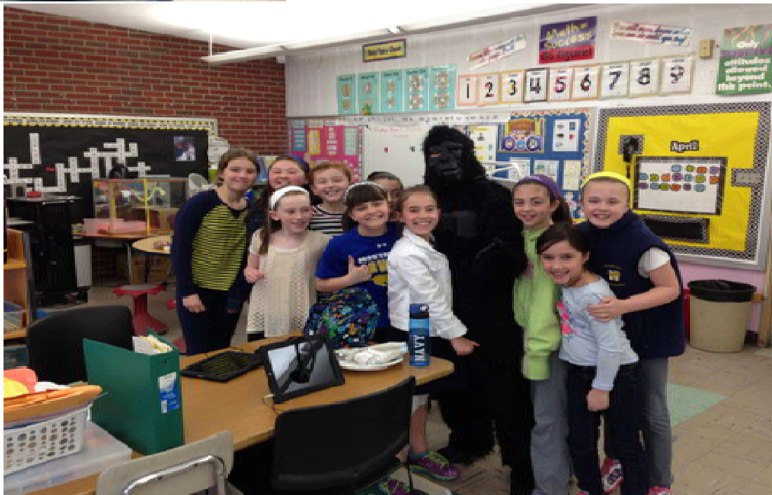
The One and Only Ivan visited the Cleveland School to help celebrate Read Across America month! These second graders were happy to share some of their bananas!