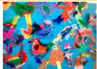
Sure signs of spring!