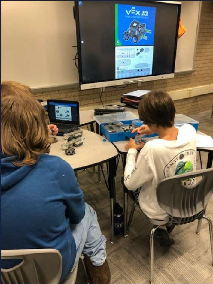
7th Grade Students building the VEX Clawbots Robots