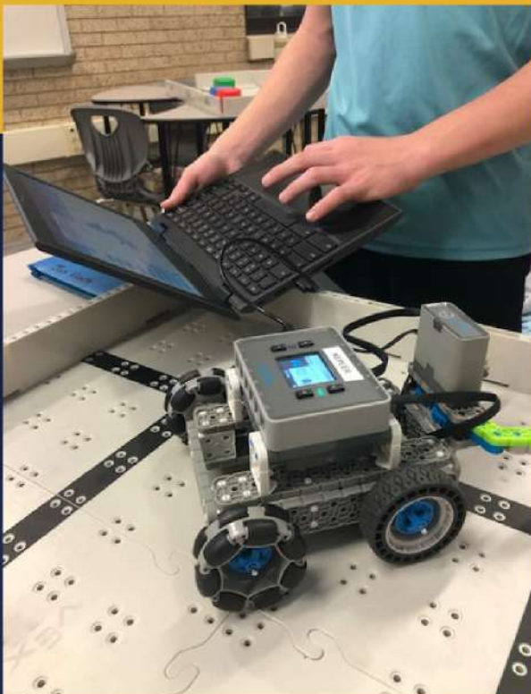
Student creating a program on his Chromebook to code the VEX Clawbots robot to complete the challenges.

December 21, 2022 at 7:30 pm 7th and 8th Grade Band Concert McCall Commons