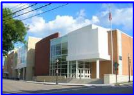
Broughal Middle School