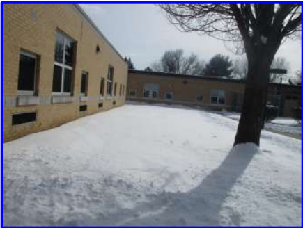
Snowy Playground Scene at Spring Garden

On February 13th, a big snow storm, Stella, hit the Northeast. The storm lasted about 2 days and some areas North got 2 feet of snow, other parts like Bethlehem had a foot or less. So, because of all that snow, we had three days off from school. There were lots of things to do during this time. For example, build an igloo or a snowman, have snowball fights, go sledding, or just stay inside. Some Spring Garden students were interviewed about what they did over the break.