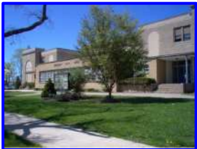
Nitschmann Middle School

Y J C L O V E R M E O W D V R S A V X U I Z N Z X F Z D U D V P D B C U P Z V I G D N G M X Z Q S G L T L Y I R G U N E R Q P L K S J G Q Z E I A Z B B I N R Y C P I W Z E W H W L W J A X W G I R M G N H C A L T I Q P A D J R I Y Q Y E M K N D L O C Z R T T N P L R Y X M C N A T E T I E A G U P Q C A Z V K H O E E Y P P I E Z S Z P I T O T H J G S Q T L X G F F A L E A A F L W U N S A Q D E P N J Q G L E M C Z O V A W O V E T E Y F S N O O F S G