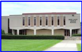
East Hills Middle School