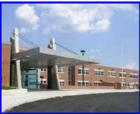
Northeast Middle School

Good luck to all future sixth graders, and enjoy your stay here at Spring Garden for the last few months! (Don't worry, we have some fun field trips planned!)