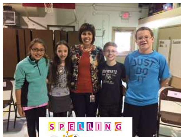
Spelling Bee Participants