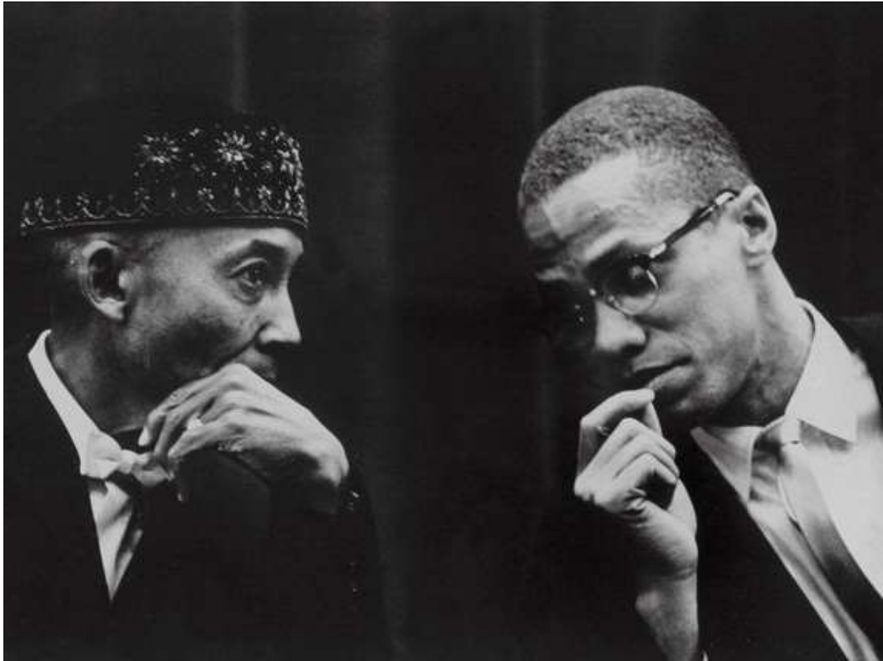
Malcolm X & The Nation of Islam