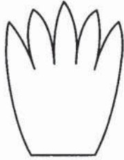
Claws for feet (Cut 4)