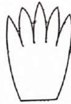
Claws for feet (Cut 4)