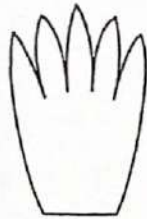
Claws for feet (Cut 4)