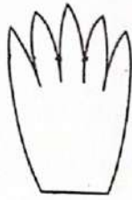
Claws for feet (Cut 4)