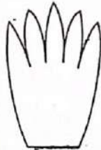
Claws for feet (Cut 4)