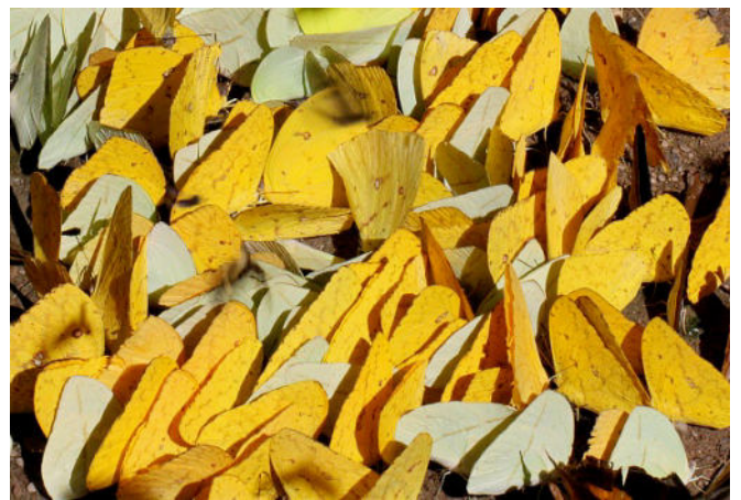
Phoebis argante and Rhabdodryas trite swarming on an Amazonian tributary

In the afternoon we travel upriver by dugout canoe. Amazon kingfishers swoop past, a harpy eagle hovers high in the sky above us. On a nearby rocky island we see a caiman basking, and along the riverbanks we see sun bitterns and the beautiful capped heron. Strings of bright yellow Eurema and Phoebis butterflies fly in follow-the-leader fashion along the river's edge. Hundreds gather to imbibe moisture on the sandbanks, erupting into flight as our boat passes.