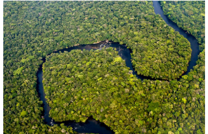
Amazon rainforest, Brazil

It is 6.00am, and we are awoken by the raucous echoing call of a troop of howler monkeys. They are perhaps 2 km away, but the sound fills the forest around us. Dawn is breaking as we venture along a trail through the primary rainforest. Mysterious butterflies flit around us. I spot where they have settled, but their amazing camouflage makes them almost impossible to locate. Some, like Taygetis angulosa look exactly like dead leaves. Others like Haetera piera , Cithaerias pireta and Ithomia agnosia are almost entirely transparent. Enormous Caligo Owl butterflies flit from one tree trunk to another. Their wings have a feathery appearance and are marked with false 'owl eyes', enough to startle any predatory bird and give the butterfly a chance to escape.