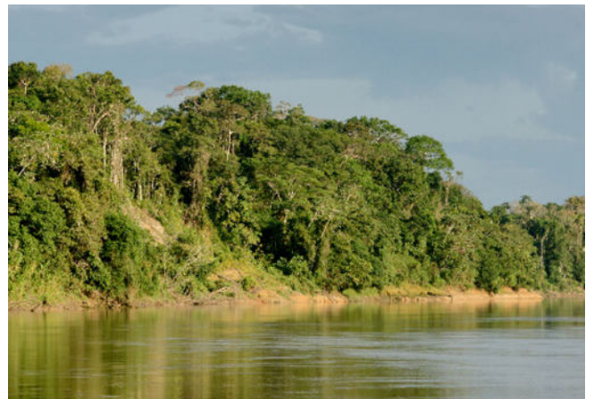
Rio Madre de Dios, Peru

The next morning we travel downstream for an hour, disembark from our dugout, and get into a jeep. We leave behind the beautiful pristine rainforest, travelling through secondary forest and then for several miles through cattle pastures, until we come to the town where we catch a plane to our next destination. For 4 hours we fly across what was formerly rainforest, but all we see is a huge expanse of semi-desert. The forest has all been burnt down and turned into cattle pasture, but the pasture only lasts for a few years, and all that remains now is a barren dusty landscape dotted with termite mounds. Looking down from our plane we see a dead parched world, devoid of life.