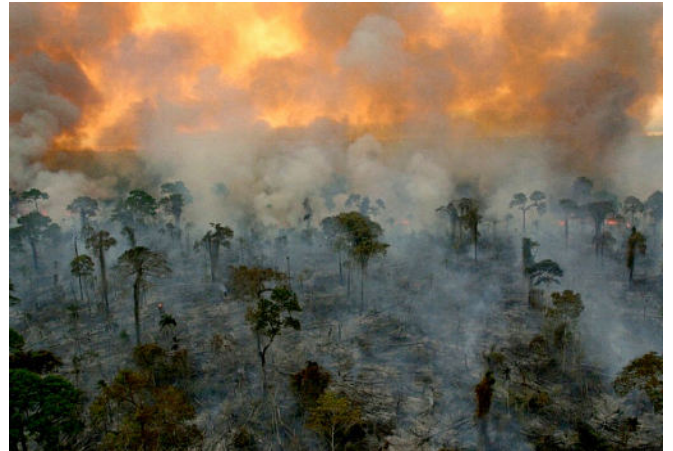
Fires raging uncontrolled in Rondonia, Brazil

Please help to save rainforests, by signing on-line petitions and lobbying politicians.