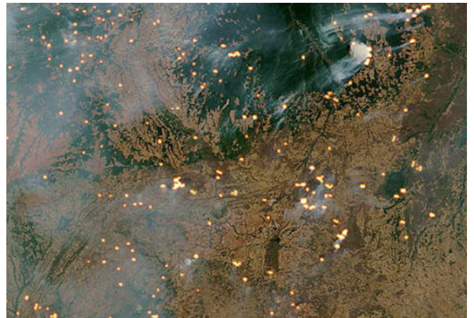
Aerial view of fires burning in the southern Amazon

Used by permission. "Butterflies of the Rainforest." learnaboutbutterflies.com. 2013.