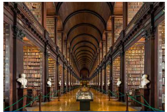
Trinity College Library

Confirmation of performances is dependent upon early receipt of performance information: biographies, pictures, recordings and repertoire