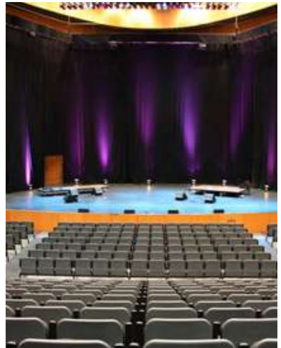
Helix Mahony Hall