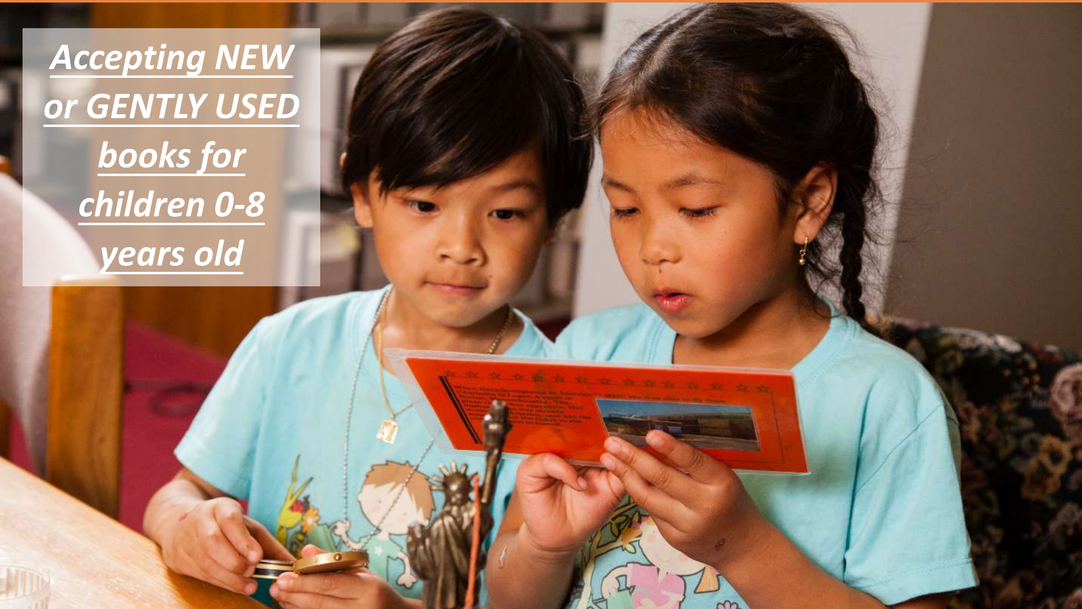
Lowell students at the Tsongas Industrial History Center

Accepting NEW or GENTLY USED books for children 0-8 years old