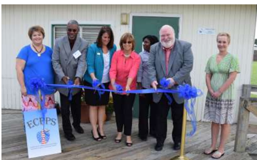
ECPPS Family & Community Center Ribbon Cutting Ceremony

ECPPS held their first Parent Academy on Saturday, September 17th, beginning with breakfast at 8:15 am. The academy was held at Northeastern High School and concluded with a ribbon cutting/open house for our Family and Community Center.