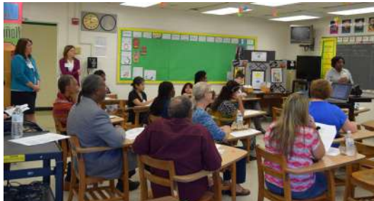
Family & Community Center Presentation