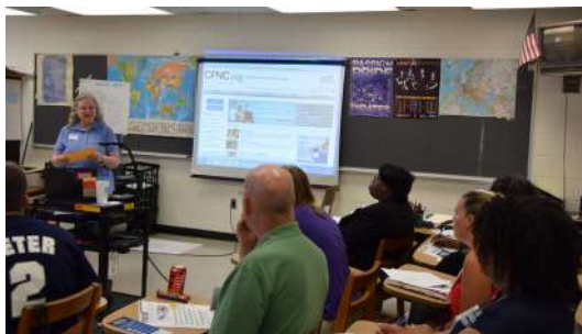
Scholarships & College Applications Presentation