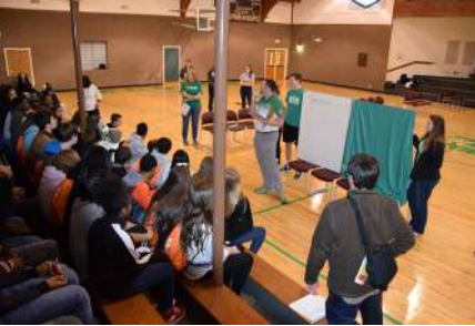
ECMS 8TH GRADERS VISITED MID-ATLANTIC CHRISTIAN SPORTS & ATHLETIC CENTER AS PART OF THE GROUNDHOG JOB SHADOW DAY