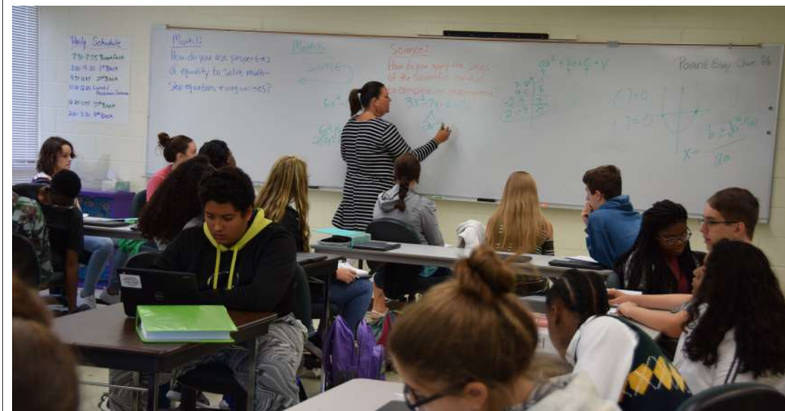
EARLY COLLEGE CLASS DURING THE FIRST WEEK OF SCHOOL. ECPEC STARTED CLASSES ON AUGUST 7TH.