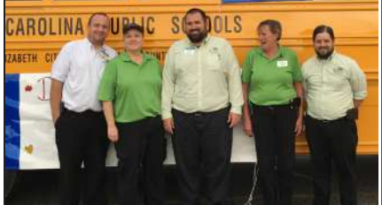
EC FARM FRESH ~ STUFF THE BUS EVENT IN PARTNERSHIP WITH WAVY TV 10 OPERATION SCHOOL SUPPLIES