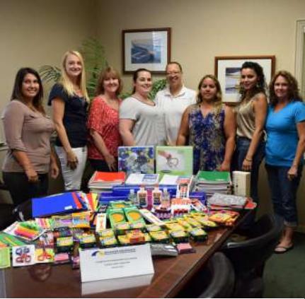
BANKERS INSURANCE ANNUAL DONATION OF SCHOOL SUPPLIES TO ECPPS