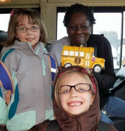
WEEKSVILLE ELEMENTARY CELEBRATES LOVE THE BUS WEEK