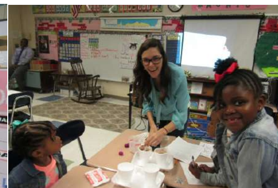
Students perform experiments in the classroom during Science Night