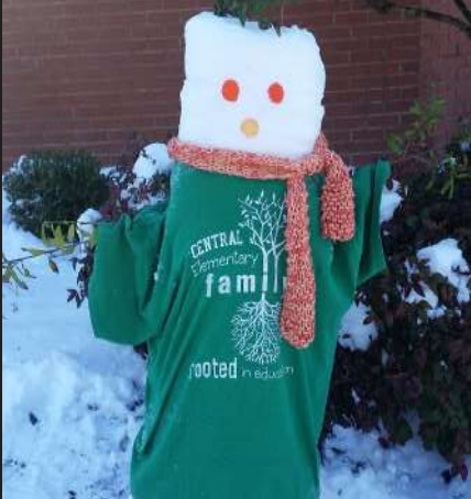
CENTRAL ELEMENTARY SCHOOL WINTER STORM 2018 - SNOWMAN