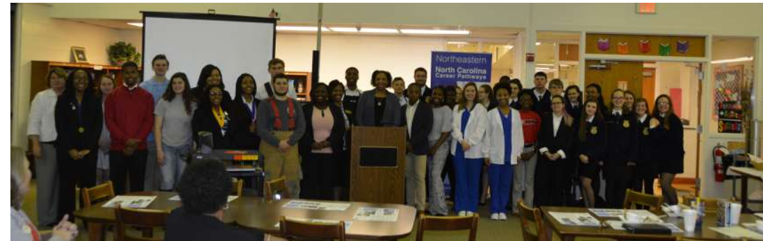
ECPPS 2018 Career & Technical Education Conference for Area Businesses Pictured are CTE Student Participants & Guest Speakers

Area businesses were invited and encouraged to attend a new event hosted by ECPPS this year, a CTE/Workforce Development Conference. The event was held March 1st at Northeastern High School.