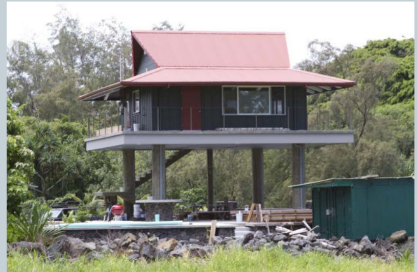
Many buildings along the Hilo, Hawai'i coast are built on pilings with the intention of withstanding flooding and tsunamis.