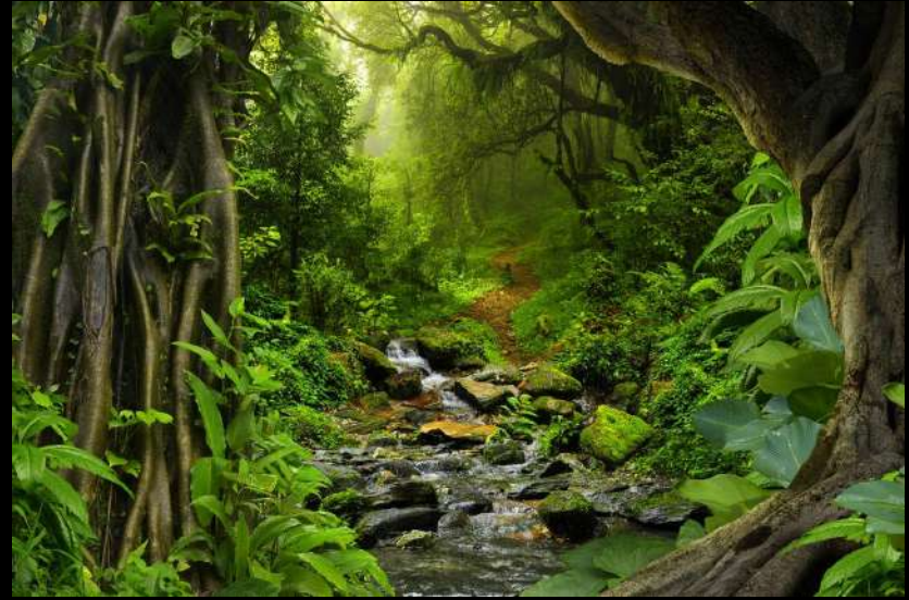
Forests & Jungles