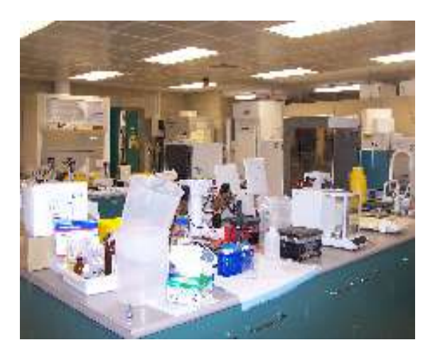
Lab Station #14: Clean up

1. What should you always remember to do before leaving the lab?