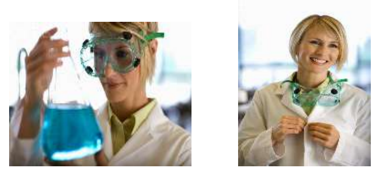
A. B. 1. Which picture accurately shows proper lab safety in the lab?

2. Write a lab safety rule for this station.