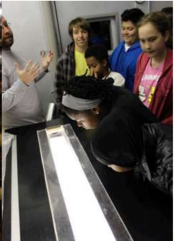
Images from Ice Core Drilling Projects on Nevado Sajama by Researchers from Byrd Polar Research Center