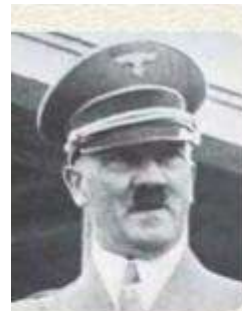
Adolf Hitler 1889–1945

After leaving prison in 1924, Hitler revived the Nazi Party. Most Germans ignored him and his angry message until the Great Depression ended the nation's brief postwar recovery. When American loans stopped, the German economy collapsed. Civil unrest broke out. Frightened and confused, Germans now turned to Hitler, hoping for security and firm leadership.