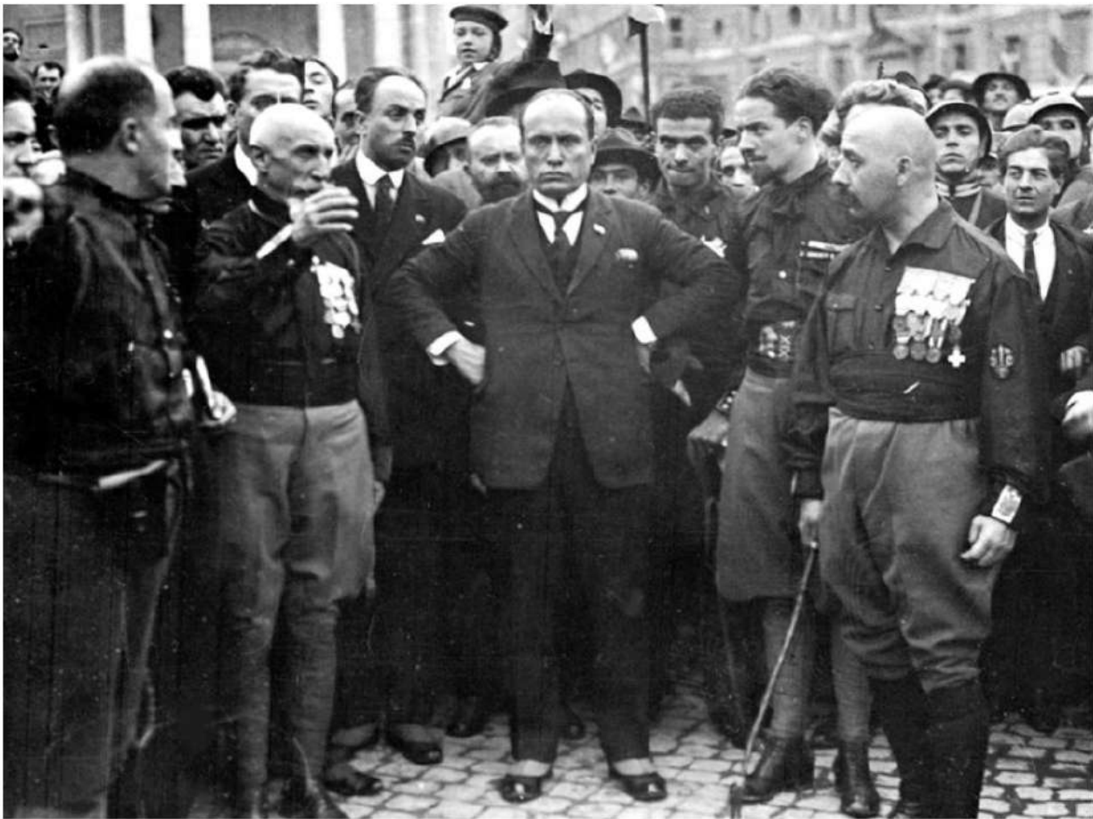
March on Rome: Benito Mussolini with three of the four quadrivirs during the March on Rome: from left to right: unknown, de Bono, Mussolini, Balbo and de Vecchi.