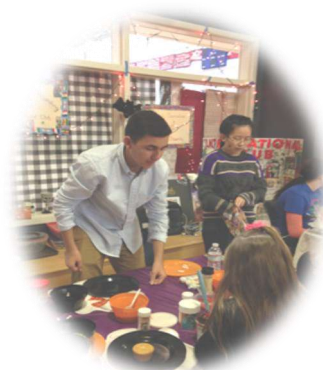
International Club Sells Baked Goods at AppleFest Fair to Donate to Doctors Without Borders