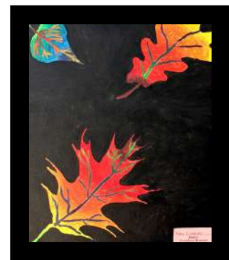
Painting by Abby Askenas '18