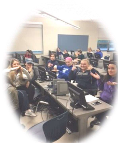
Students Taking American Sign Language Course