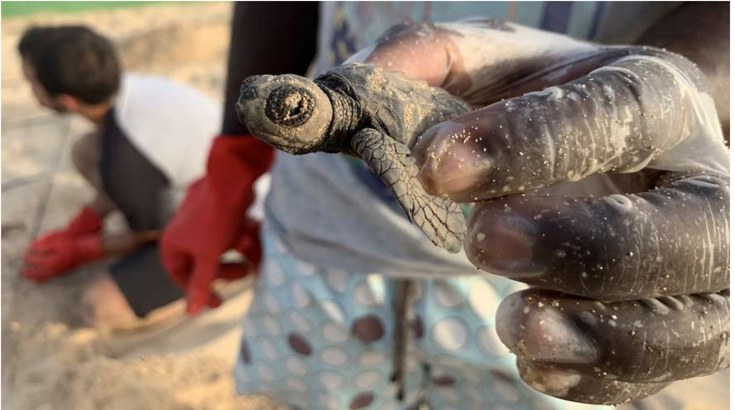
Image 1. A marine biologist holds a hatchling in Boa Vista, Cape Verde.

BOA VISTA, Cape Verde — She emerged from the ocean just before midnight. The sea turtle clambered up the shore as her ancestors have for 200 million years.