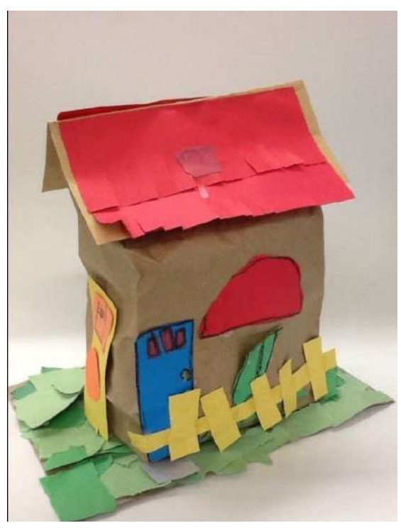
Week 2: Cut and glue construction paper or cardboard scraps to the outside of the bag, add a roof, windows, a door and other details to make it look like your dream house