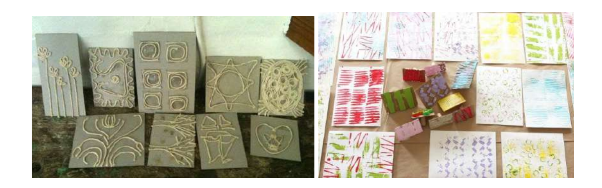
Week 1: Collect your materials! You can use foam stickers, yarn, puzzle pieces, cardboard (both as a base and scraps of cardboard to glue onto your base!), dried beans, pipe cleaners, bottle caps, etc.

A Collagraph is a method of creating a print (or a stamp) to make artwork. They can easily be made by using a simple piece of cardboard or wood as a base and gluing objects on top to create a design. This design is then used to create prints by painting and stamping the collagraph onto paper. Here are some examples of what collagraphs look like: