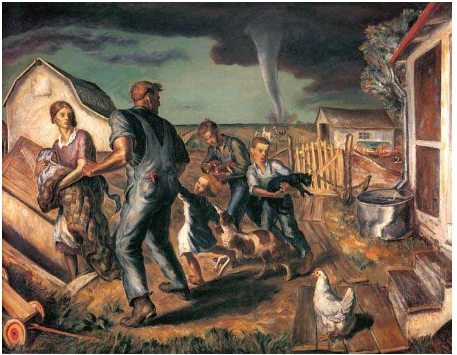
Curry, Tornado , 1929, o/c, 46 1/4 x 60 1/2, Muskegon Museum of Art, Hackley Picture Fund purchase.

The career of John Stewart Curry spanned only two decades: from 1924, when he first exhibited at the National Academy of Design in New York, until his death in Madison, Wisconsin, in 1946. They were, however, decades that shook the foundation of American life and art. Defined by the Great Depression and the country's entry into World War II, they were years of upheaval that would reshape the economic, political, and social structure of the nation and challenge the spiritual, and moral grounding of all humanity.