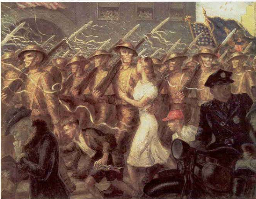
Parade to War, 1938

By 1936 Curry had earned official recognition as a painter of and for rural people. Yet he died only a decade later misunderstood and disappointed. Upon his death in 1946, the Wisconsin State Journal paid him the following tribute: He was not content in the artist's attic. He was a stranger to the ivory tower; He knew what art means in its deeper significance and he toiled to show it to others, to inspire an appreciation and an active interest in it for thousands of people to whom it had been something a million miles away from their own lives his Wisconsin rural artists, farmers and village housewives were his pride and joy. A youngster he could help with a brush or an idea was a thrill to him beyond his biggest mural. ["John Steuart Curry," Wisconsin State Journal, 30 August 1946.]