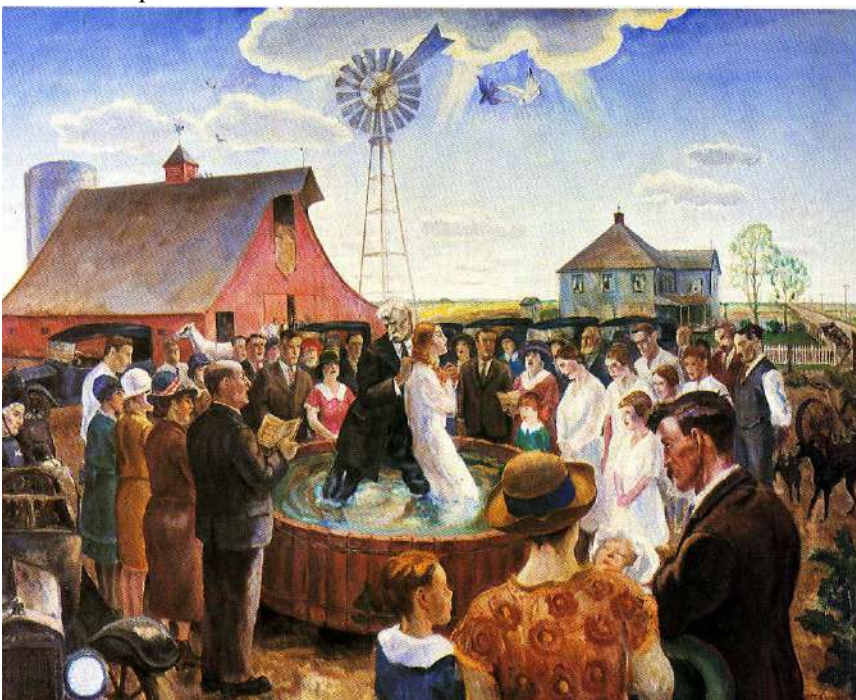
Curry, Baptism in Kansas , 1928, o/c, 40 x 50, Whitney Museum of American Art, gift of Gertrude Vanderbilt Whitney.

Through two decades of dramatic change, Curry held fast to an art that took as its foundation the relation of humankind to nature and of men and women to one another. Inevitably this son of a Kansas stockman saw that interconnectedness most clearly in rural life. In his paintings, inspired by the lives of people of rural Kansas, Curry gave form to issues that extended far beyond America's Middle West. He articulated both the complex concerns of his generation and universal human experiences. He elevated the rural Midwestern landscape to a higher level of discourse—to a consideration of social and spiritual values.