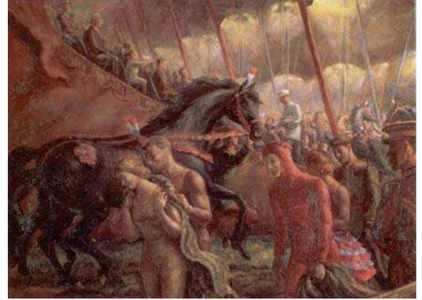
Curry, The Runway , 1932, oil on masonite-process fiber building board, 30 x 397/8, Swarthmore College Art Collection.

The restive, even dispossessed farm families he encountered on his 1929 trip home to Kansas were one kind of marginal group. The troupers of the Ringling Brothers and Barnum & Bailey Circus, with whom the artist traveled for a few months in 1932, were another. These individuals inspired a group of genre paintings whose subjects are easily regarded as members of the American scene's sideshow. Migrant road menders, uprooted farmers, and circus itinerants all contradicted traditional views of stable family and community. Their often pathetic lives and heroic survival served as living parables of faith tested—as emphatic reminders that God works in strange ways.