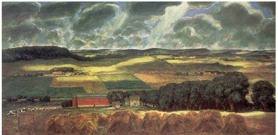
Wisconsin Landscape, 1937-1939, o/c, 42 x 84, The Metropolitan Museum of Art, George A. Hearn Fund.

These were years of reflection rather than innovation for his art. They were also years of discouragement, as the painter struggled with public scrutiny. The Wisconsin years should have signaled fulfillment for a populist like Curry, but, ironically, experiences in the last decade of his life shook his faith in populism. Although Curry's works brought him critical acclaim and the admiration of fellow artists, they failed to garner him wide public acceptance. They failed to appeal to "his people." Fellow Kansans denigrated his Topeka murals, driving him away from the project in disgust, his work never completed. Curry could not recover from the hurt. Wisconsin Landscape , painted at the request of a group of the country's leading agriculturists, was refused by those who had commissioned it.