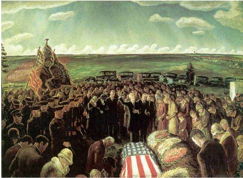
Curry, The Return of Private Davis from the Argonne , 1928-40, o/c, 38 x 52, The Warner Collection of Gulf States Paper Corporation.