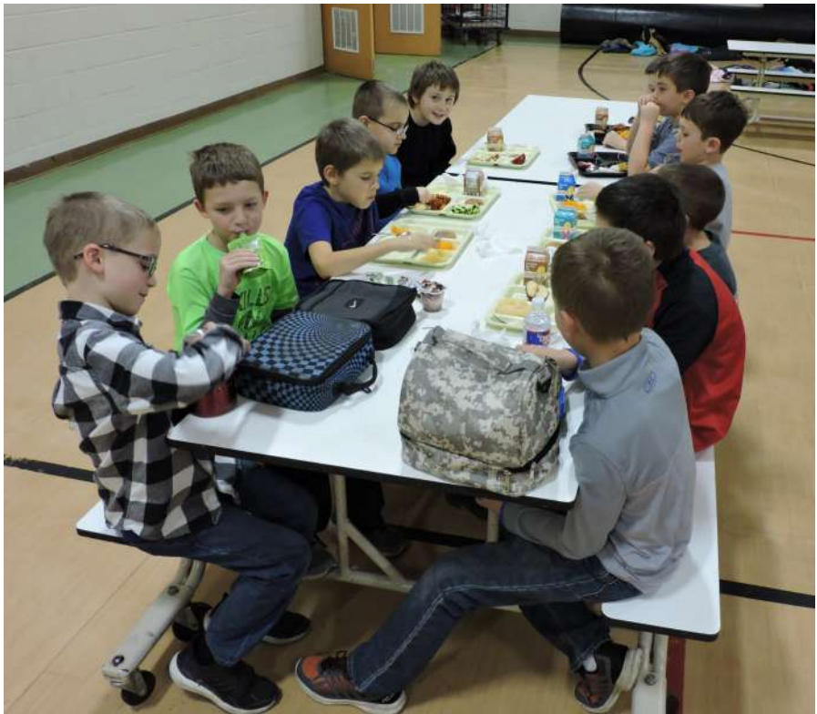
Some of the third grade boys chat with they eat their lunches.