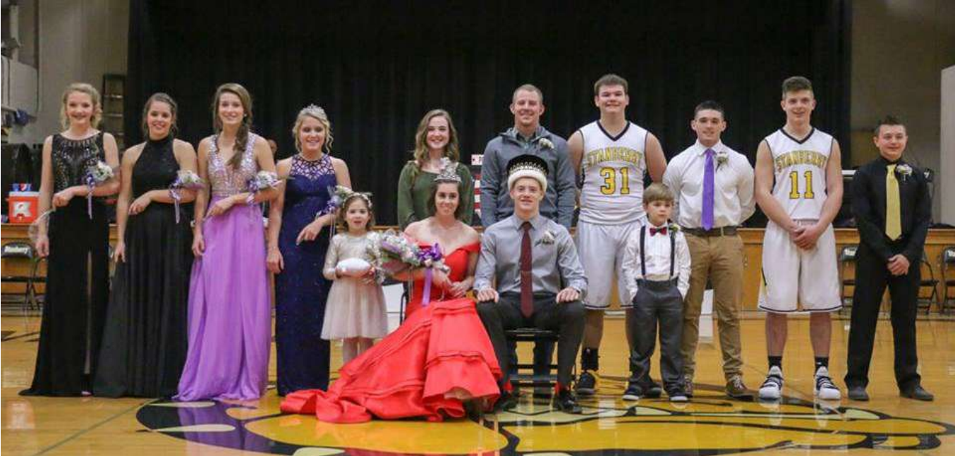
The entire Sportswarming court