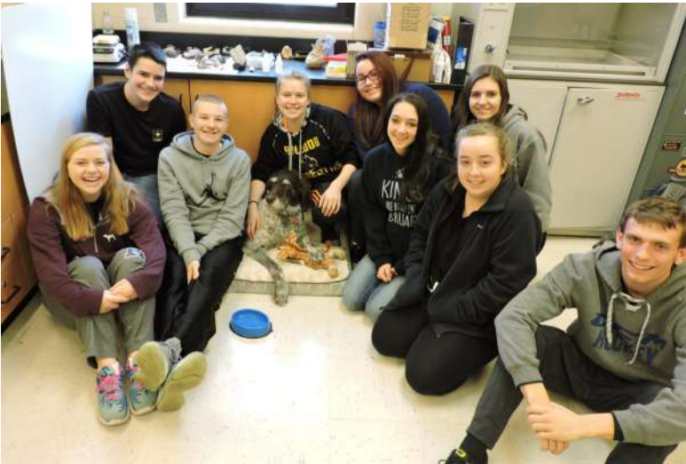
Several students in science class enjoy Magellan's presence.

was there waiting with a look on his face that said, 'where have you been'? We knew he was an expert geographer and master explorer. In his younger years, no fence could fully contain Magellan, and he would periodically go on 'expeditions.' These have waned over the years, but he is still known to slip out the door for an adventure. Magellan is a master at Animal Assisted Therapy and has been visiting schools since 2010. He was a regular at several elementary schools in Texas and at Eugene Field Elementary (Maryville) and West Nodaway High School (Burlington Junction) in Missouri. His therapy work started as an ARF dog (Animal Reading Friend) where 1 st – 3 rd graders read to Magellan out loud. There was no judgement – only encouragement, and reading levels improved over the year. At the high school level, Magellan is here to reduce stress and be a calming influence in the classroom. Animals in the classroom facilitate an atmosphere of trust, nurturance, and relationship building. Animals actually help a person to focus on a task because of an interest in interacting with the pet. The therapy animal is a nonjudgmental companion in the process of learning and development, and science proves that these benefits are indisputable. This is also a mutually beneficial relationship for students and Magellan because it