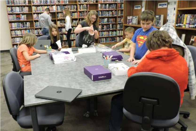
The third graders enjoy using the library’s maker space.