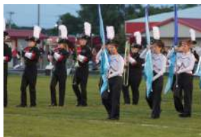
New Band Uniforms