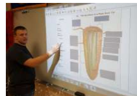
Mimio Boards at the High School