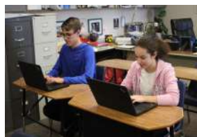
New computers for the High School Business Education classes