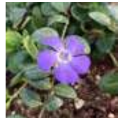
Periwinkle (Evergreen groundcover)