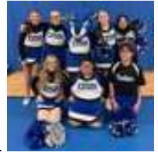
OSB Cheer Squad

The girls did really great and got the crowd fired up.