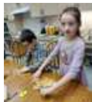
How to bake some cookies ...

Students learning helpful "every day" tasks during their Independent Living Skills (ILS) classes: