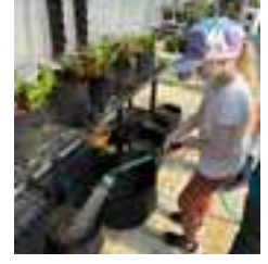
Watering is important