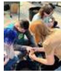
How does a potato feel?