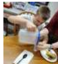
How to fill a glass without overfilling it...