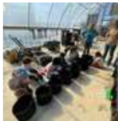
Students in front of their planter buckets.