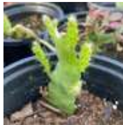
Christmas Cactus (succulent)

Here are a few images of some of the beautiful plants the students are growing: