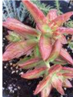
Firestorm Sedum (succulent)