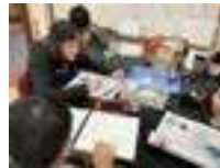
Compasses & Magnetism