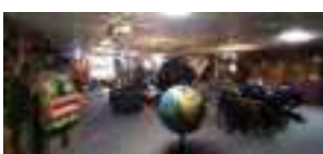
Our "Library's Magic World" welcomes you.