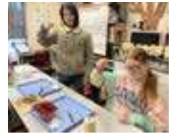
Homemade bird feeders

Students are studying food and shelter needs for familiar wildlife.