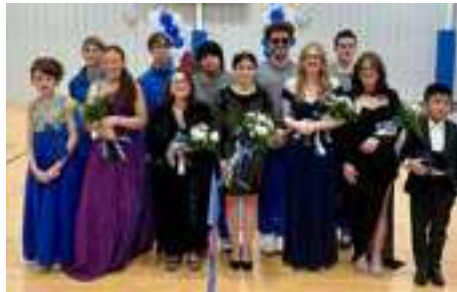
2024 Homecoming Court

The wrestling was difficult and we did lose the dual but our guys poured their hearts out and left everything on the mat.