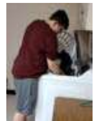
How to do laundry ...