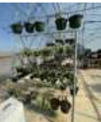
A glance into the OSB greenhouse.

Here are some random pictures showing Mrs. Page teaching Elementary students how to plant potatoes and what "Greenhouse class" looks like: