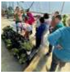
Elementary students are ready for planting...