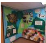
Outside the library

The students also participated in extended library hours where they were able to come up to the library and explore their favorite books and expand their imaginations.