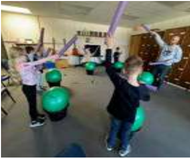
Future OSB drum line?