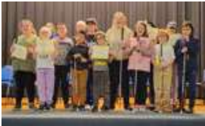
Spelling Bee contestants with their certificates

Each student was given a graded list of words with difficulty ranging from 1 st - 8 th grade to study in preparation for the Spelling Bee.