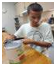
How to use a can opener...