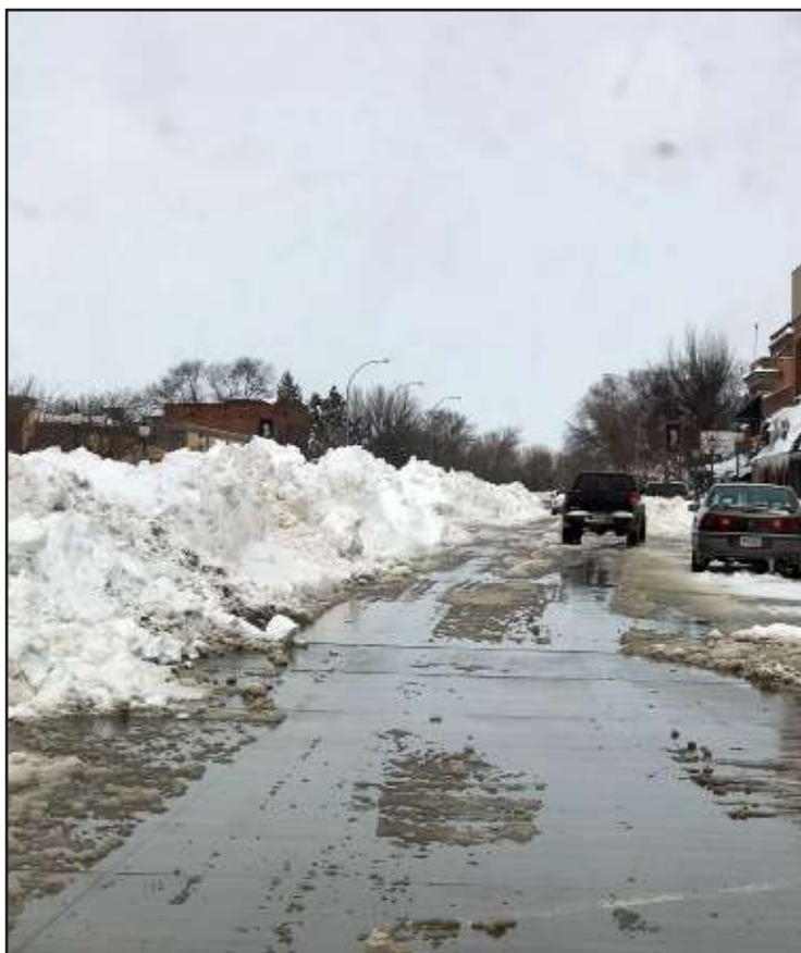
The streets of Redfield were piled high with snow after the latest blizzard that dumped approximately 24 inches of snow. School was cancelled for three days on April 10, 11 and 12.

Even though the spring sports season has been a struggle this spring, the athletes and their coaches are hopeful that the weather will straighten out and they can resume their normal routines.