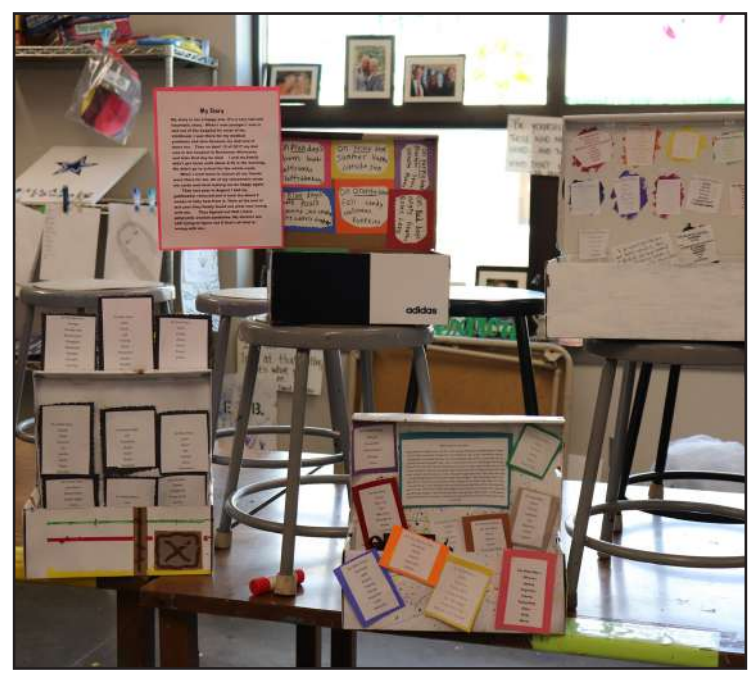
Students were able to use any type of medium to decorate their boxes. The colors used are to represent the feelings and thoughts the students have. The Empathy Project will be on display for the week of May 6th through May 10th.