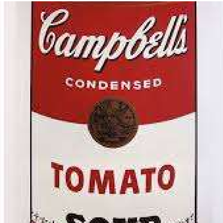
Campbell's Soup Can (1962)