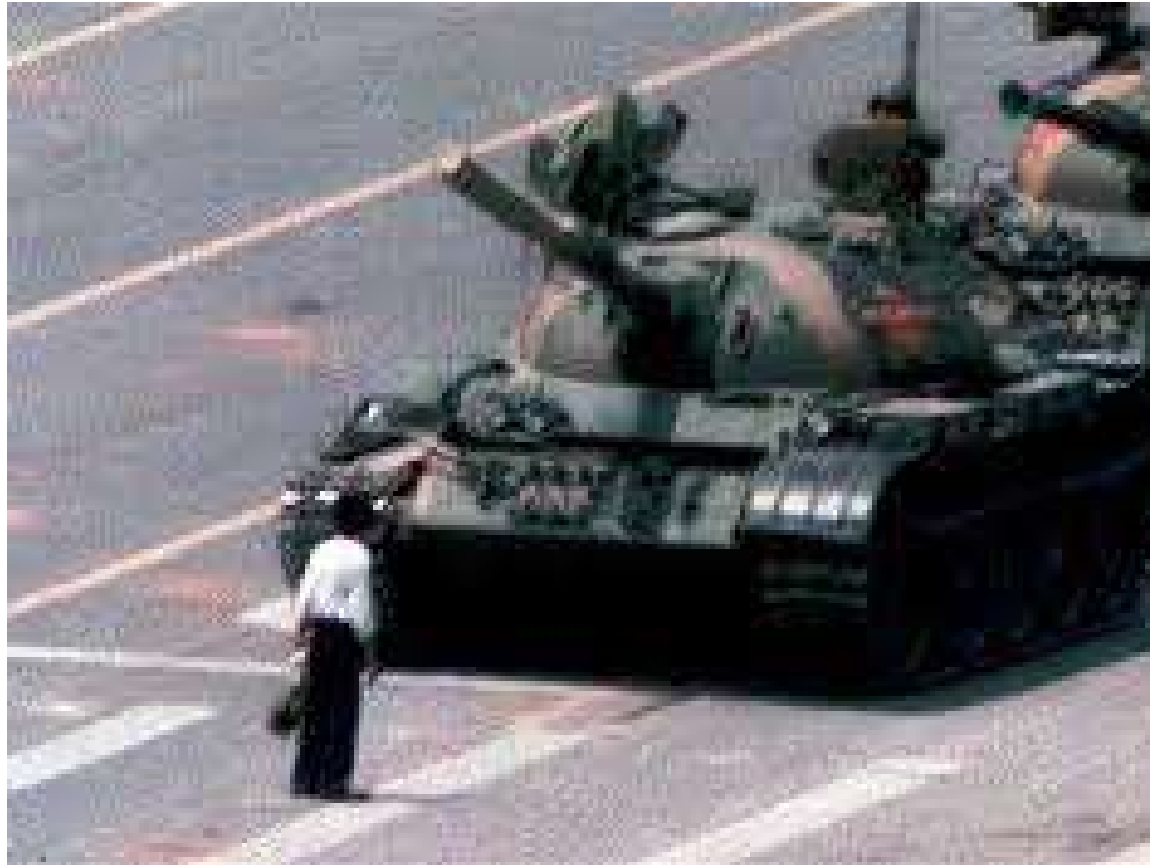
Tiananmen Square “Tank Man” (1989)