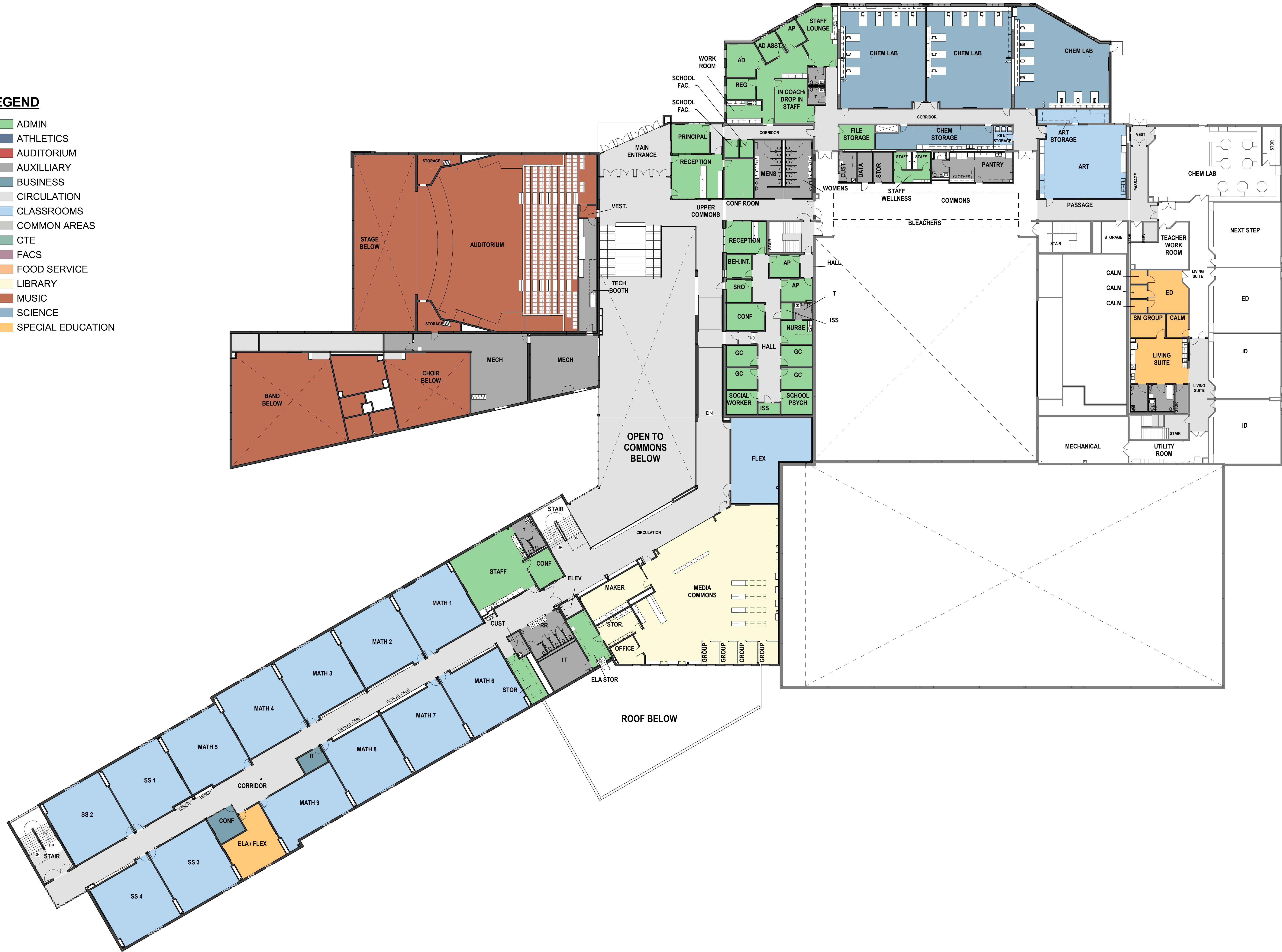
Level 2 Floor Plan