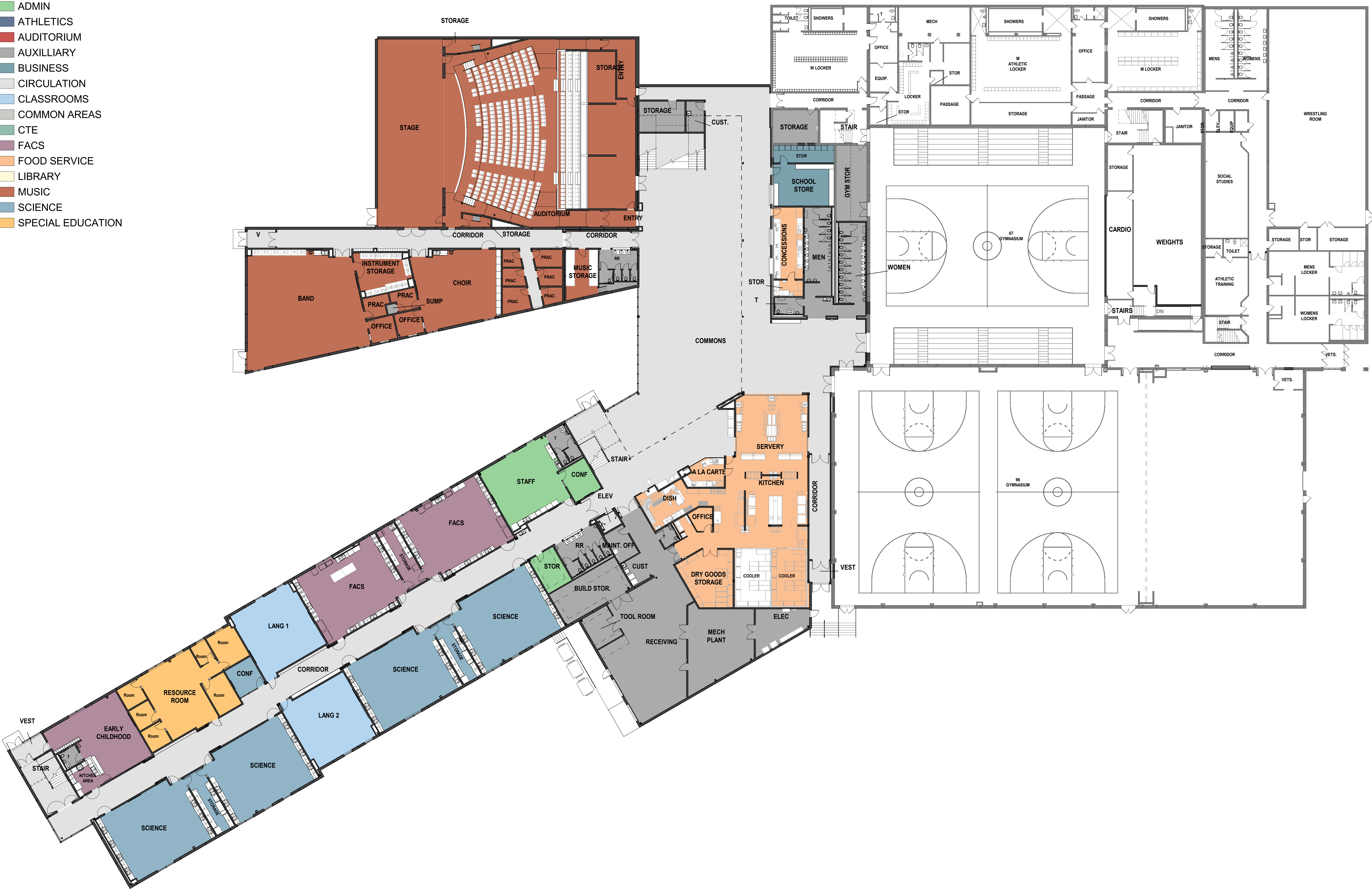
Level 1 Floor Plan