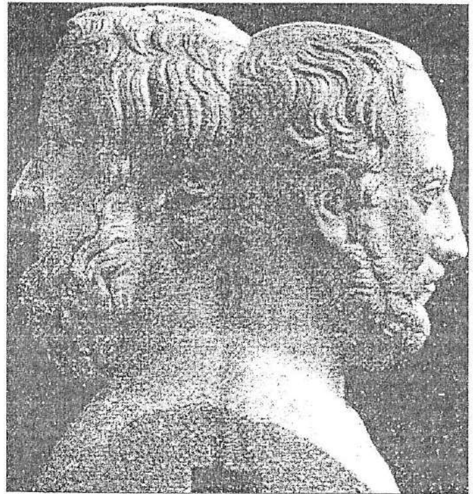
A sculpture of the two great Greek historians, Herodotus and Thucydides.

Herodotus probably started writing intending just to cover the two Persian Wars. When he finished, however, he had added huge amounts of background material that filled the first half of The Histories .