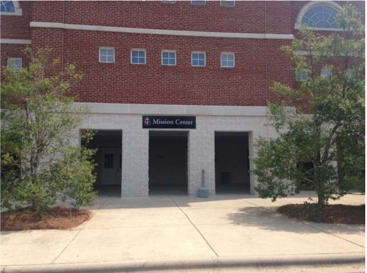
Photo 3- The door to the testing area is under the Mission Center sign.