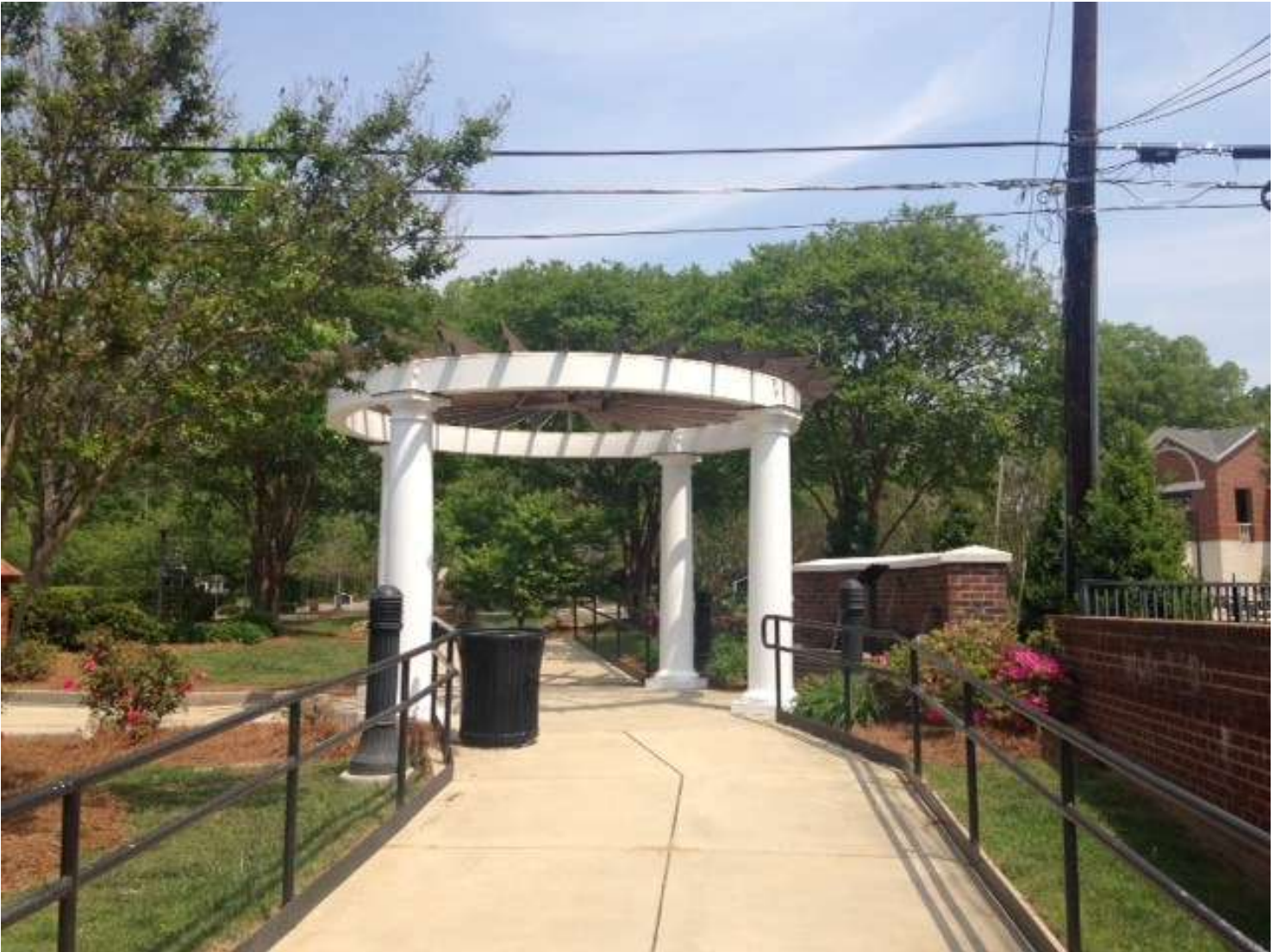
Photo 1- What you will see when you exit the lower parking lot on foot!

Please see the photos on the next two pages!