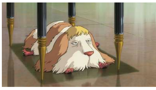
Heen (Breed: Petit Basset Griffon Bandan)