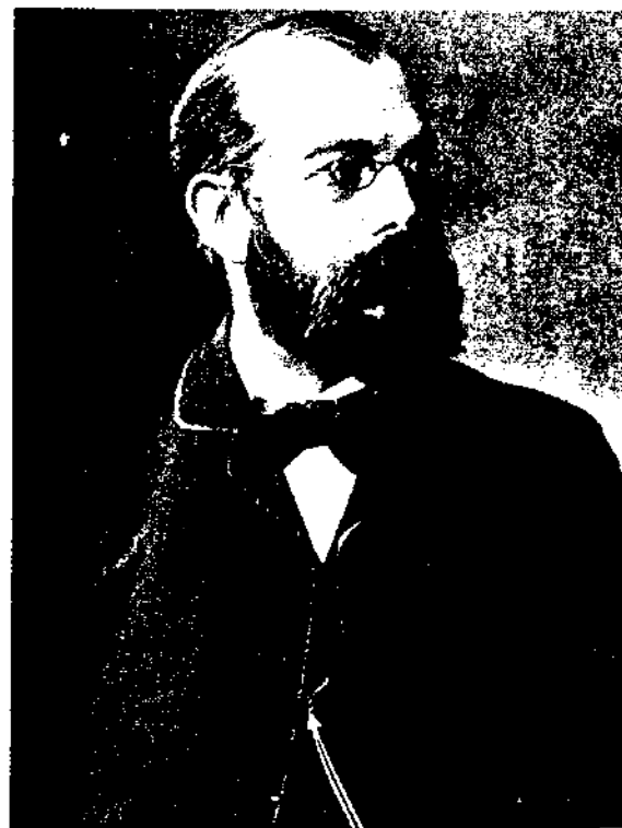
Figure 4 Robert Koch (1843–1910).

Differential staining techniques soon followed, allowing Frederick Loeffler in 1890 to demonstrate the presence of bacterial flagella. During this period, rapid developments occurred in methods for identi-