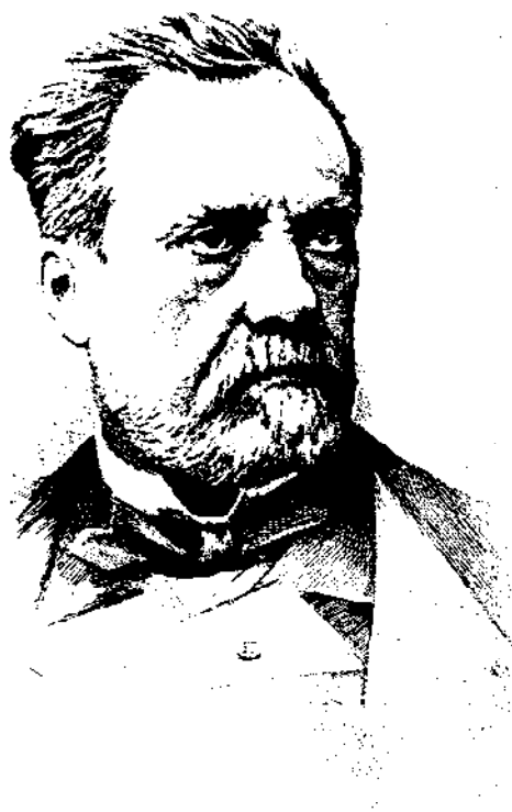
Figure 3 Louis Pasteur (1822–1895).

It is often assumed that Pasteur's experiments