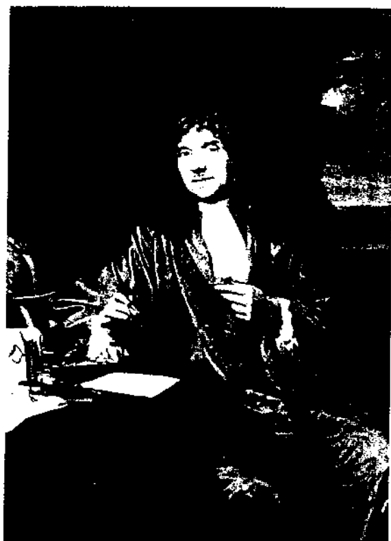
Figure 1 Anton van Leeuwenhoek (1632–1723).

croscopes (Fig. 2) to examine microorganisms in rainwater, well water, and seawater as well as water infused with peppercorns. His observations were forwarded to the Royal Society in London on October 1676 and were later published in the Society's Philosophical Transactions . In 1683, van Leeuwenhoek contributed a second letter to the Society describing his various microscopical investigations, including novel observations on bacteria present in the scurf of teeth. Published in 1684, these observations include the first drawings of bacteria ever to appear. These drawings are still extant and clearly show that van Leeuwenhoek observed bacilli, streptococci, and many other characteristic forms of bacteria. van Leeuwenhoek's meticulous drawings also show protozoa such as Vorticella , Volvox , and Euglena . At about the same time, Huygens also reported observations on a number of free-living protozoa, including species of Paramecium . Van Leeuwenhoek also gains credit for describing the first parasitic protozoan, when in 1681 he observed his own fecal stools during a bout of diarrhea and described large populations of what later became known as Giardia lamblia .