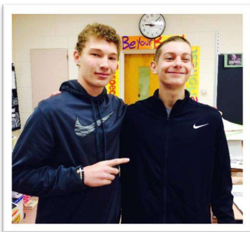
Period 2: Runner-Up and Champion