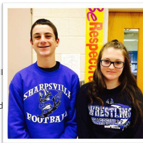
Period 5/6: Champion and Runner-Up