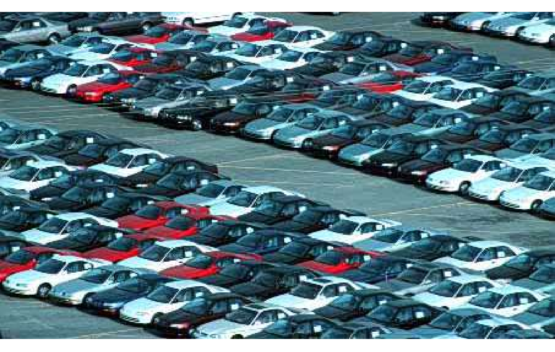
Representativeness Heuristic: Which would you pick?