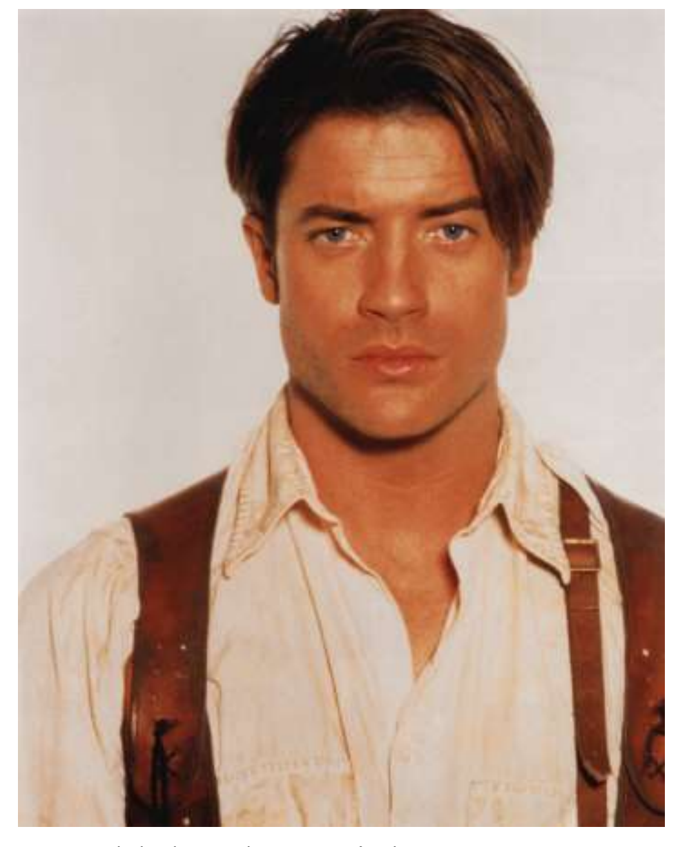
Availability Heuristic: Who would do a better job as an action star?