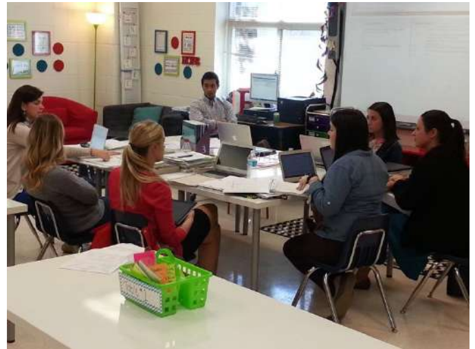
Hawk Ridge teachers working hard during early-release day to prepare for next quarter's instruction