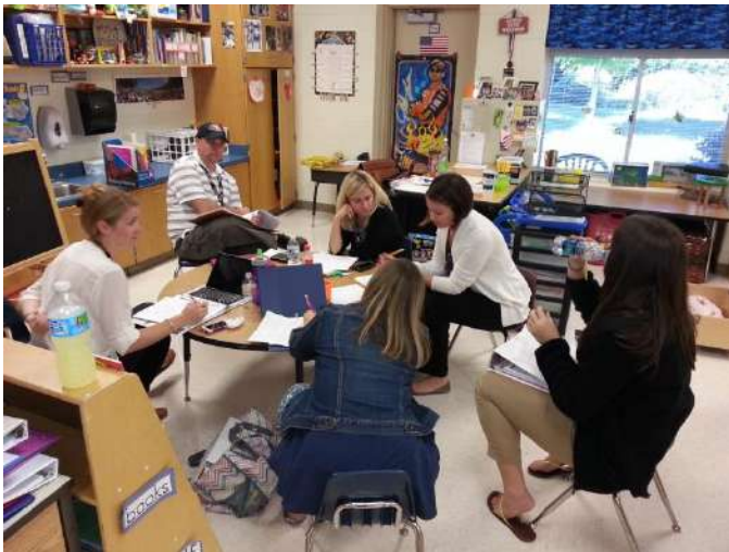
Let's make it a great ninth and tenth week!