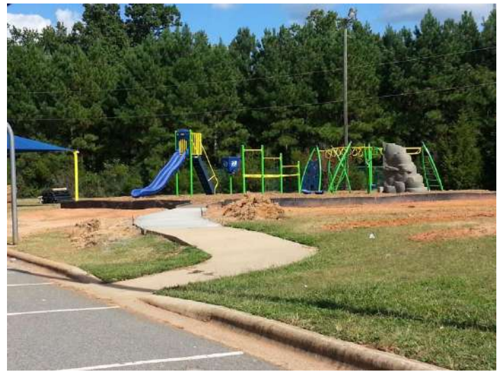
Our new playgrounds are finally finished!