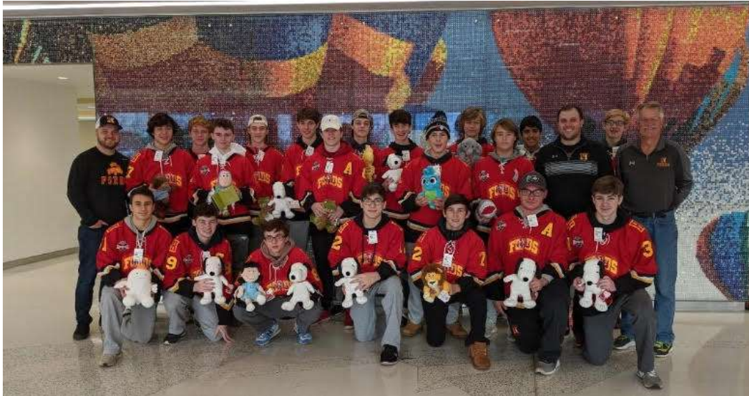
Ice Hockey team visits St. Christopher's to bring stuffed animals to patients

Congratulations! Haverford Ice Hockey beats Garnett Valley 8 to 2...still undefeated in the Central League! Go FORDS!