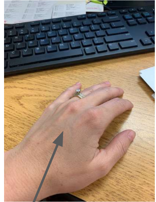
After holding arm up for 10 seconds